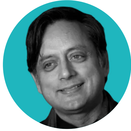
Dr Shashi Tharoor

Author, Politician & Former International Civil Servant