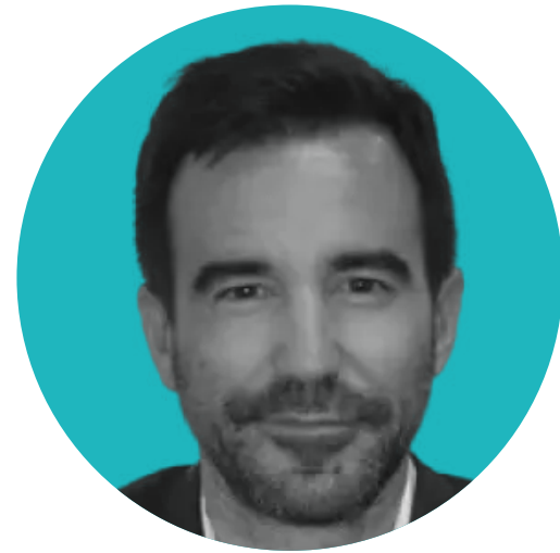
Dr. Tomas Chamorro-Premuzic

Former CEO HCL & Founder & Chairman – Sampark Foundation