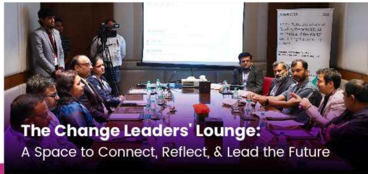
The Change Leaders' Lounge: A Space to Connect, Reflect, & Lead the Future

This space is fluid and informal, fostering genuine dialogue and transformative ideas. The Circle Of Breakthroughs embraces spontaneity and creates pop-up experiences that inspire, challenge, and engage.