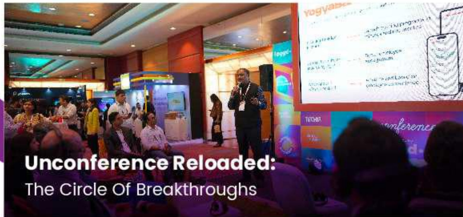
Unconference Reloaded: The Circle Of Breakthroughs

This is a dynamic, conversation-only open stage at the heart of the conference. Designed for immersive and off-beat interactions, it's a place where leaders break from traditional presentations to engage directly with attendees through live Q&As, experiential activities, and big debates.