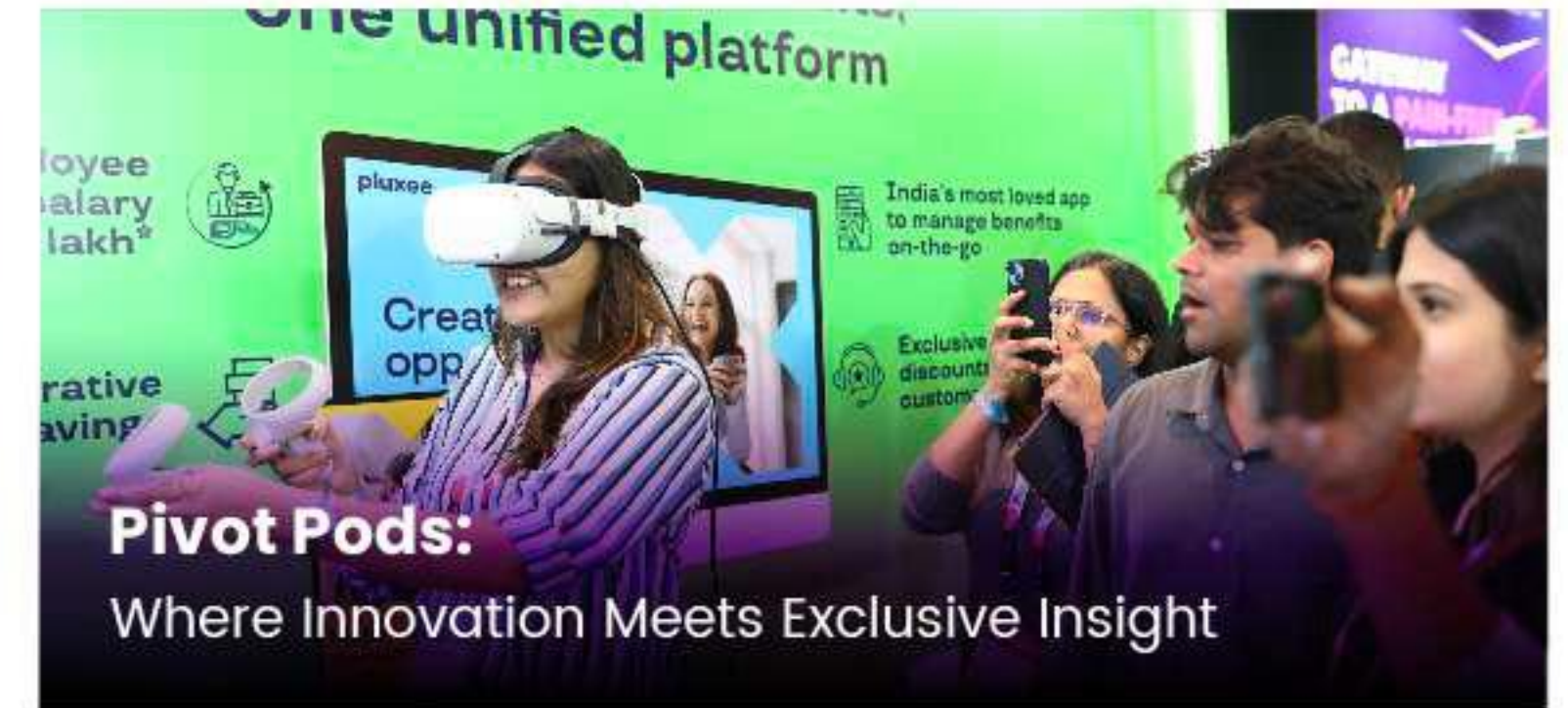
Pivot Pods: Where Innovation Meets Exclusive Insight

An exclusive, invite-only lounge tailored for influential leaders driving transformation in their organisations. Nestled within the space of the conference, it offers a blend of privacy and openness, designed to foster meaningful connections and discussions. It's more than a lounge—it's a hub where ideas evolve, relationships strengthen, and futures are shaped.